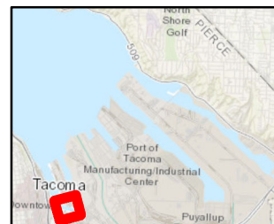
Exhibit A Land Sold to Cascade Pole